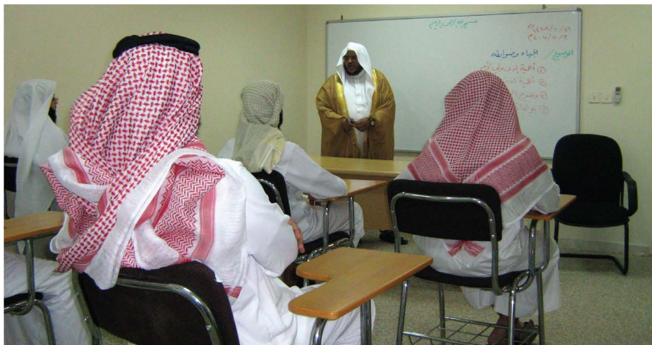
A Saudi rehabilitation class discussing the rules of jihad, just one part of the country's counter-radicalization efforts.

T HE PROMINENT ROLE of the internet in propagating and perpetuating violent Islamist ideology is well known. The speed, anonymity and connectivity of the web have contributed to its emergence as a powerful source of knowledge and inspiration; it is an unrivaled medium to facilitate propaganda, fundraising and recruitment efforts. The vast scope of information available, coupled with the absence of national boundaries, facilitates ideological cohesion and camaraderie between disparate and geographically separated networks. 1 A broad spectrum of individuals turn to the internet to seek spiritual knowledge, search for Islamist perspectives and attempt to participate in the global jihad. As such, identifying methods to short-circuit internet radicalization has