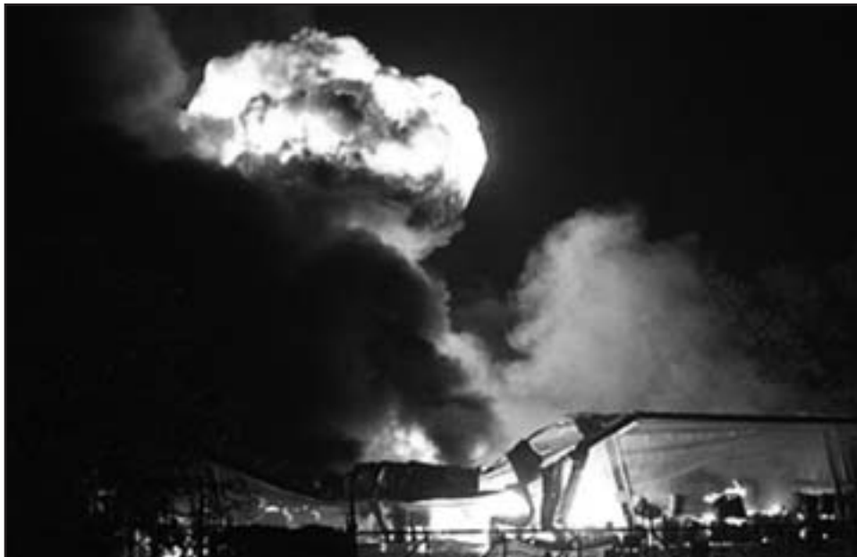
Figure 2. Initial Explosion and Plume Cloud.