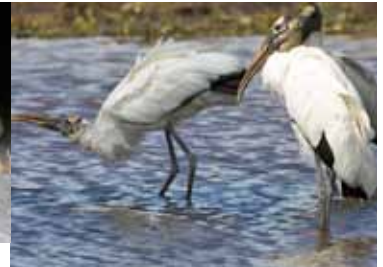
Woodstorks

The U.S. Fish and Wildlife Service is concerned about 38 federally listed species protected under the Endangered Species Act that could potentially be impacted by the oil spill in the Gulf of Mexico. Of those, 29 are endangered.