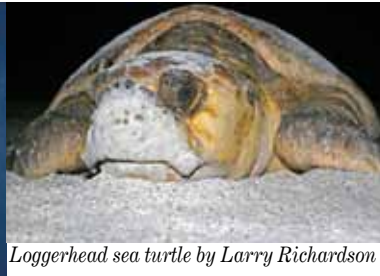
Loggerhead sea turtle