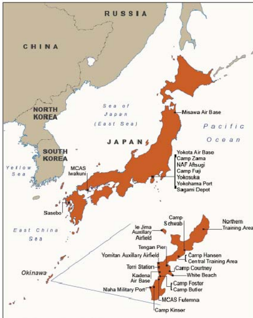
Figure 2. Map of Military Facilities in Japan

In general, Japan's U.S.-drafted constitution remains an obstacle to closer U.S.-Japan defense cooperation because of a prevailing constitutional interpretation of Article 9 that forbids engaging in "collective self-defense"; that is, combat cooperation with the United States against a third country. Article 9 outlaws war as a "sovereign right" of Japan and prohibits "the right of belligerency." Whereas in the past Japanese public opinion strongly supported the limitations placed on the Self-Defense Force (SDF), this opposition has softened considerably in recent years. The new ruling coalition in Tokyo remains deeply divided on amending Article 9 of the constitution and is unlikely to take up deliberation of the issue in the near term. Since 1991, Japan has allowed the SDF to participate in non-combat roles in a number of United Nations peacekeeping missions and in the U.S.-led coalition in Iraq.