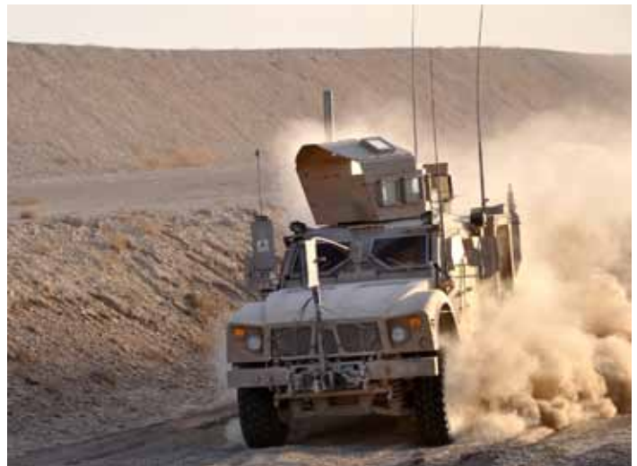
M-ATV with Objective Gunners Protection Kit