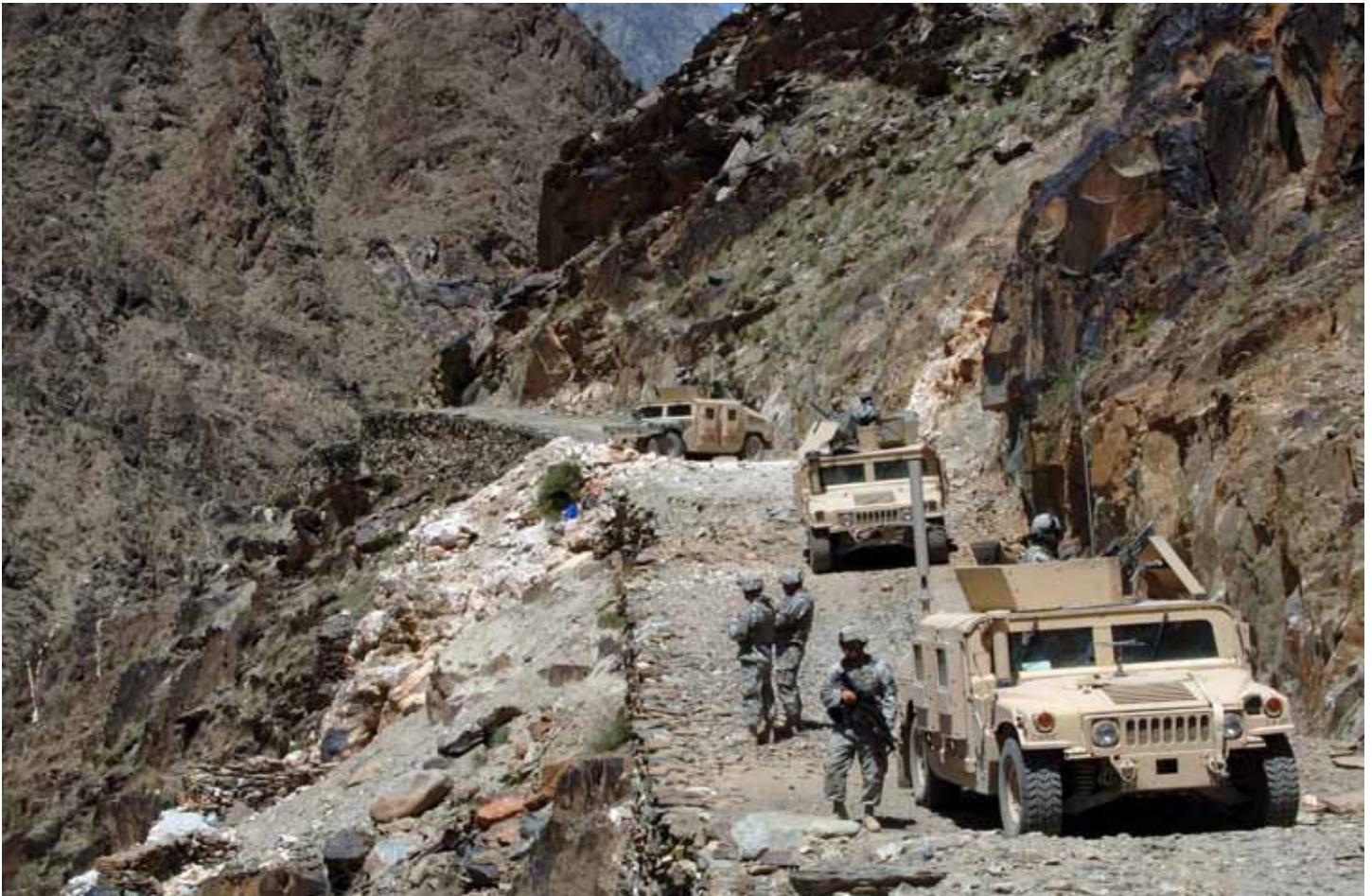
Unit Patrol in Afghanistan Mountains