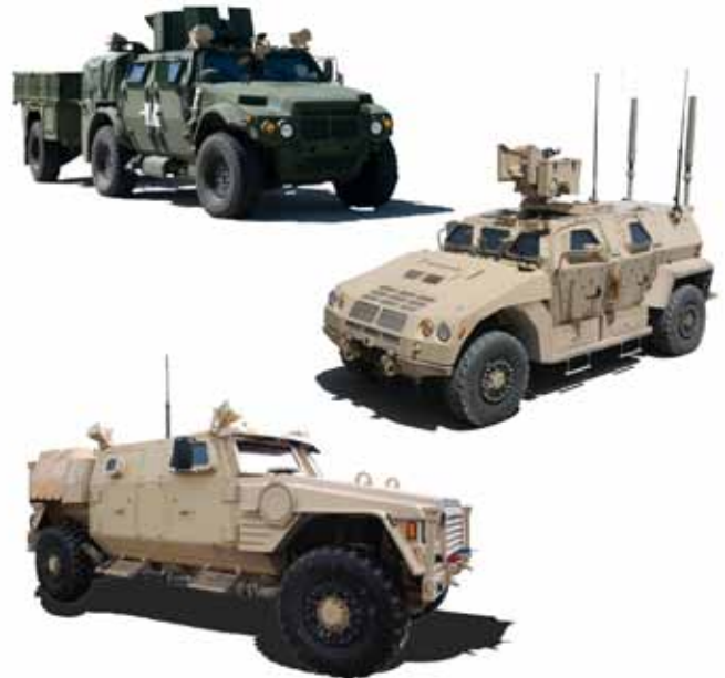
JLTV Technology Demonstrators

CATC: Payload capacity of 5,100 pounds. Includes the following two variants: Shelter Carrier/Prime Mover/Utility (2 seats) and Ambulance (3 seats + 2 litters).