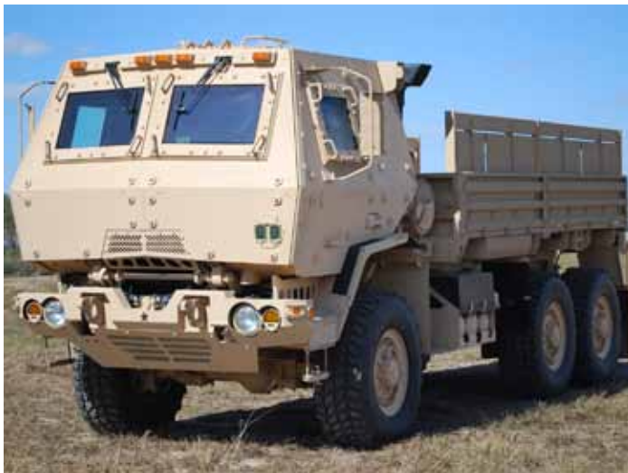
M1083A1P2 FMTV with B-Kit Armor

The Army's on-hand level of MTVs is currently equivalent to its force structure requirements, not including additional requirements in support of theater Operational Needs Statements (ONS). The Army requirements for the FMTV FoV have and will continue to increase to meet emerging DI requirements. These new requirements come as a result of armoring