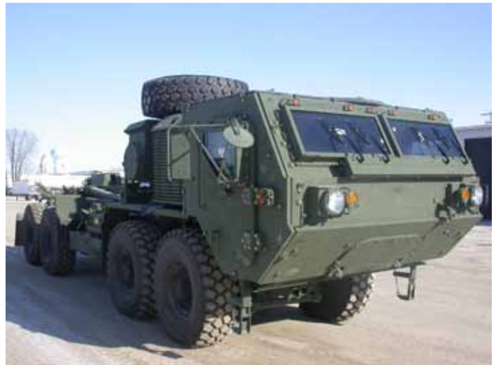
M1120A4 LHS with B-Kit Armor

The PLS is a key Army transportation system and is composed of a prime-mover truck with integral self loading and unloading capability, a 16.5-ton payload PLS-trailer and demountable cargo beds (Container Roll-On/Off Platform (CROP)/flat racks). The vehicles can be equipped with material handling equipment, winches, or Container Handling Units (CHUs). The primary mission of the PLS is the rapid movement of combat configured loads of ammunition and all other classes of supply, either containerized or non-containerized. The system also includes a PLS trailer, an Enhanced Container Handling Unit (E-CHU) for transporting 20 foot International Organization for Standardization (ISO) containers, a CROP, or M1077 flat racks.