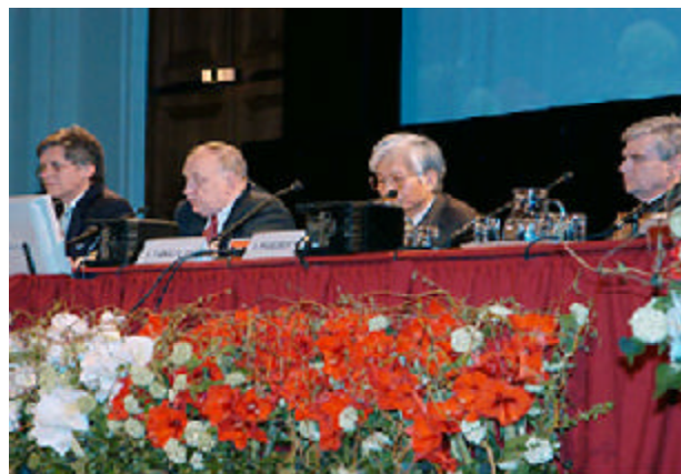
Ambassador Brooks, who chaired the conference after Secretary Abraham left for Russia, reviews the conference findings with the group.

The strong turnout reflects the growing importance of high-risk radioactive source security issues for countries around the world. Conference participants discussed identification and control of high-risk radioactive sources on a global scale, and shared