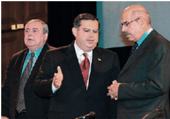
Russian Minister of Atomic Information Rumyantsev, Secretary Abraham and IAEA Director General ElBaradei discuss ways to secure dangerous radioactive sources.

The conference sessions resulted in an extensive set of “findings” to guide states in their work within their own borders and with the international